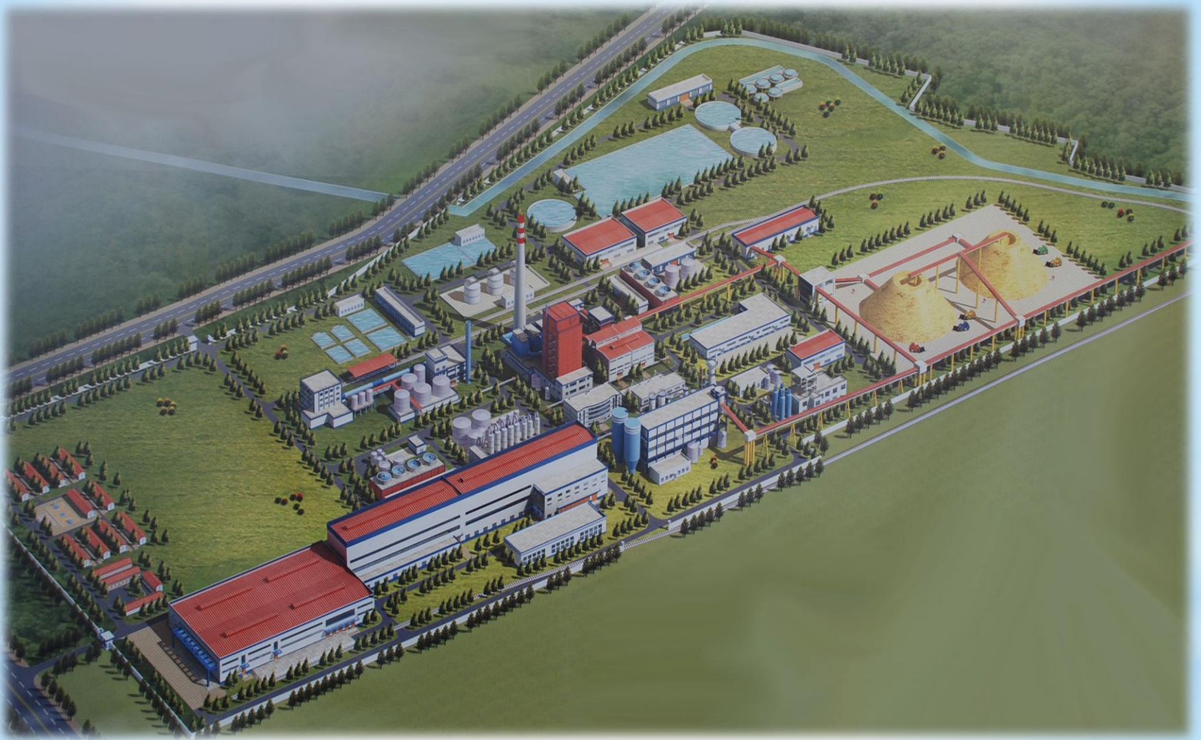
Plan of new plant